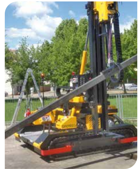
MAGNET KIT (accessory)

New Stage 5 / Tier 4 final compliant engines, watercooled and equipped with a diesel particulate filter