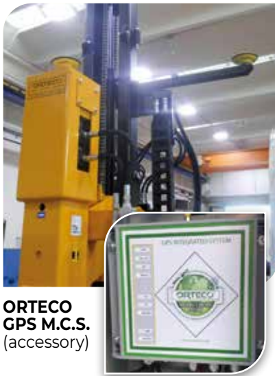
ORTECO GPS M.C.S. (accessory)