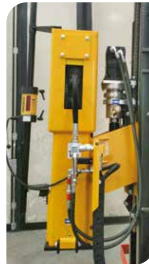
LASER KIT (accessory)